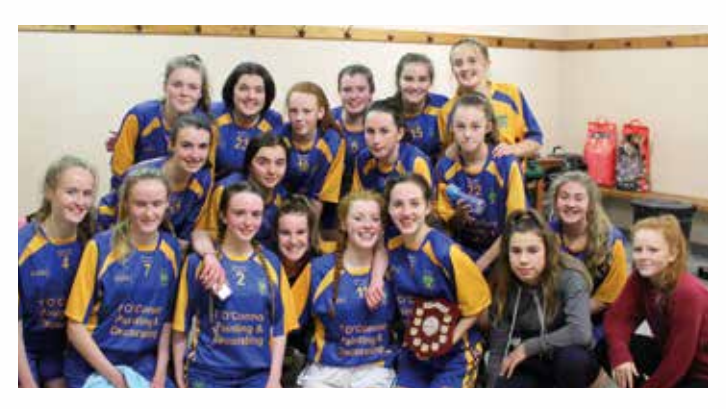
East Kerry U16 Division 3 Champions